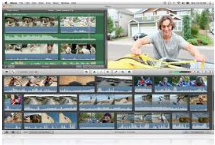
iMovie 11 editing interface

For Apple users, there's iMovie 11 . It's part of iLife '11 and included with every new Mac computer. Among its capabilities are templates that allow you to produce movie trailers, a fun feature when you're trying to build buzz on Facebook or Twitter for your organization's program, product or service.