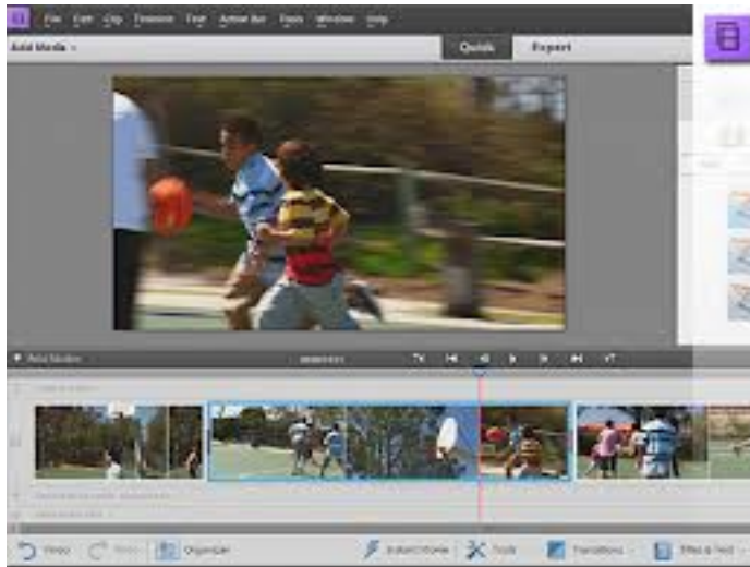
Adobe Premiere Elements editing interface

Before purchasing any video editing program, it is essential to check the System Requirements for the product, and see if the computer you're going to run it on meets those requirements. I work with a lot of government agencies and associations, and generally find that the standard-issue computer from the I.T. department is not properly configured to give you a satisfactory editing experience. Video files are big, so you need plenty of hard drive storage (including an external drive or network location for backup), plenty of ram, a speedy dual or quad-core processor and a decent-size screen. You will also want to have Administrator access to your computer, because you need to be able to download updates, plug-ins and add-ons periodically to keep everything up to date and give you additional features.