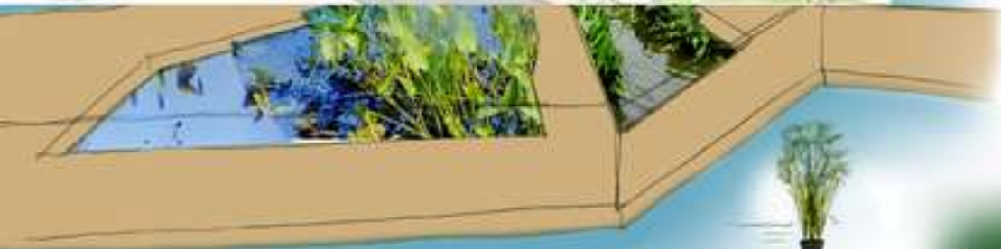
The Water's Edge