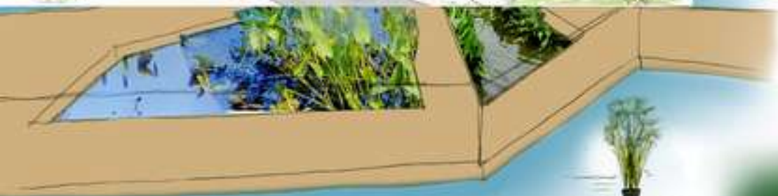
The Water's Edge