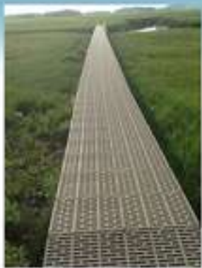
Example of Plastic Dock Material

Window Walks: The 3-FT wide walkways crisscross the pond, inviting people out onto the water. The walk-ways frame windows on the water, which will be sites for rotating botanical exhibits.