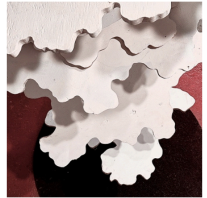
Stacy Latt Savage