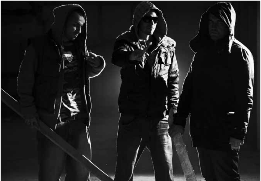
An argument that disparity of force existed may be used when multiple assailants attack.

Legally speaking, likely it was lawful for the defender to use force in self defense, but in court the claim is made that he or she used excessive force. Under these circumstances, the defendant will need to show the jury, or a judge if the case is