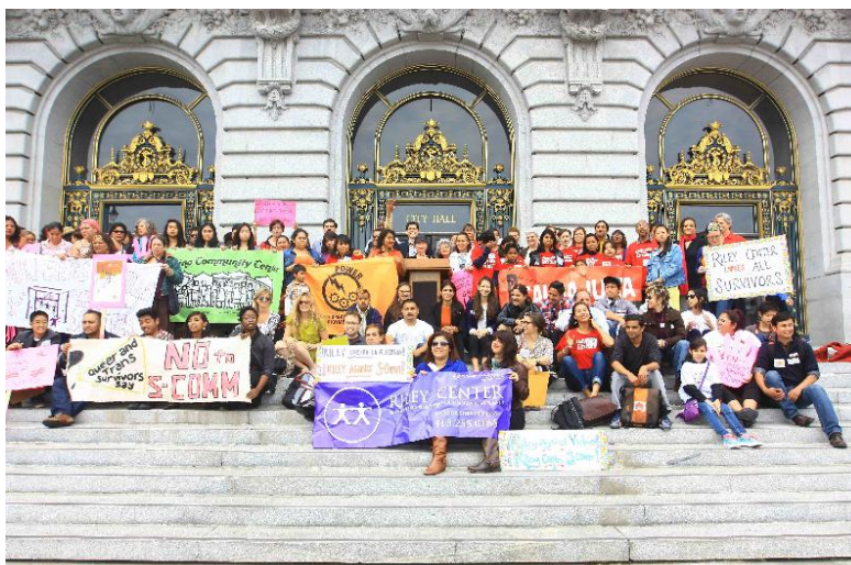
Due Process for All Ordinance Press Conference and Rally at City Hall, San Francisco

Pangea's commitment to policy advocacy continues through lobbying, drafting legislation, educating, and working closely with our coalitions and community members.