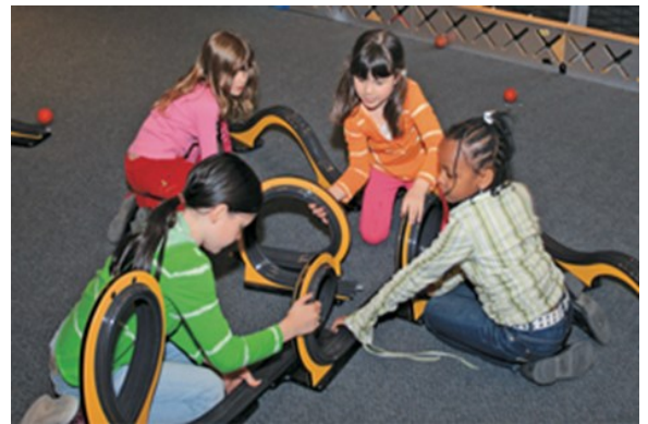
On the right track