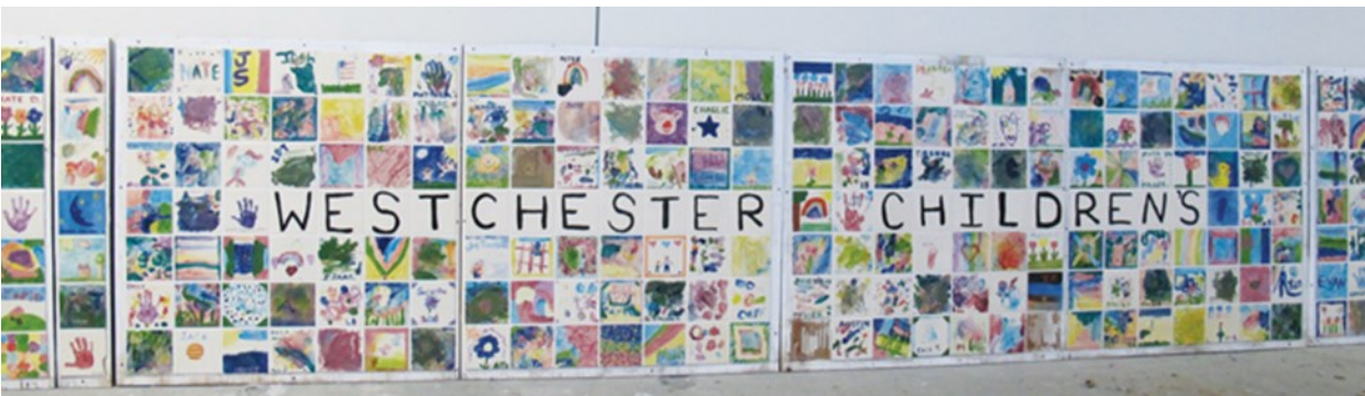
Tiles hand painted by young hands who can't wait to see a children's museum in their backyard.