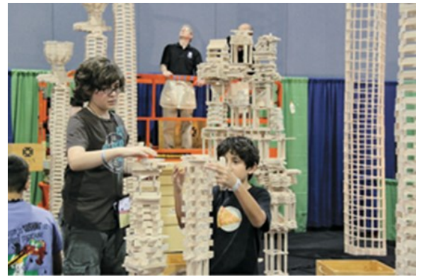
Better building with Keva Planks

Tickets and sponsorships for the Spring Gala are available at www.discoverWCM.org/special-events . Call 421-5050 for summer museum hours and admission donations.