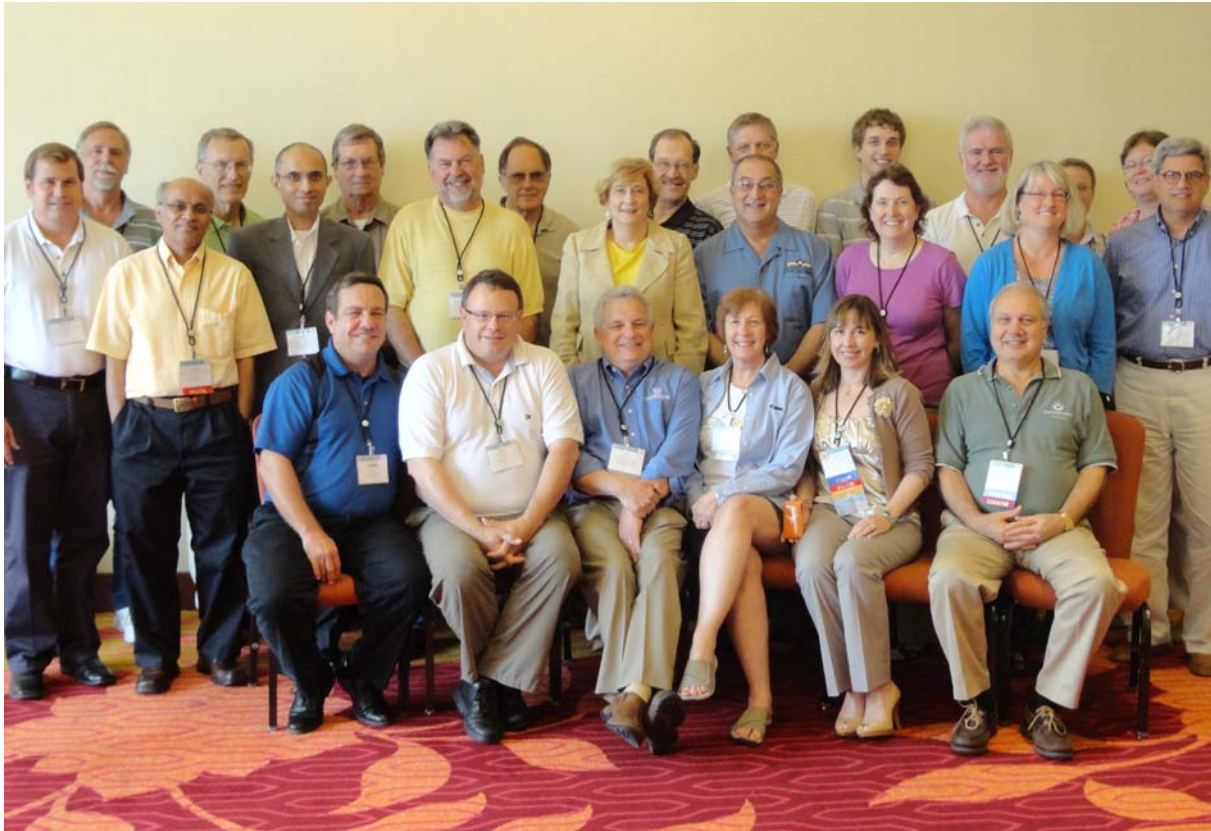
Sections & Chapters Council meeting at 2012 ACE in San Antonio, Tx.