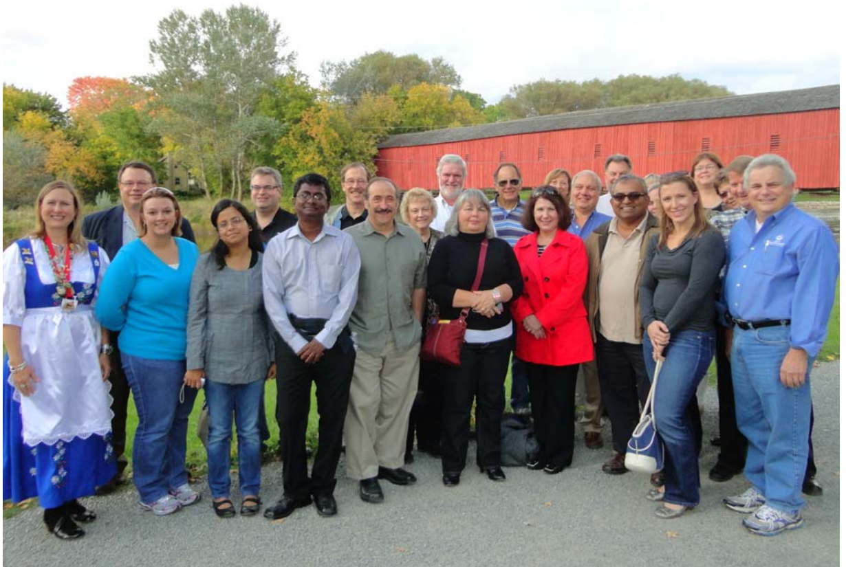
Sections & Chapters Council meeting at Waterloo, Ontario, Canada, September 28-30, 2012