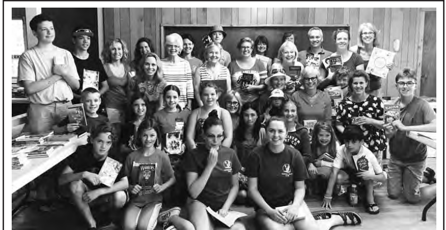
2017 VB Book Sale Volunteers

The Yacht Club Dance is approaching. On Sunday, August 6 The Brock Street Bandits and the Sunset Soundsystem will have the VBCC rocking again. More details to follow - look for posters and Herald updates. Tickets will be available starting in the next couple of weeks at your favorite VB establishments.