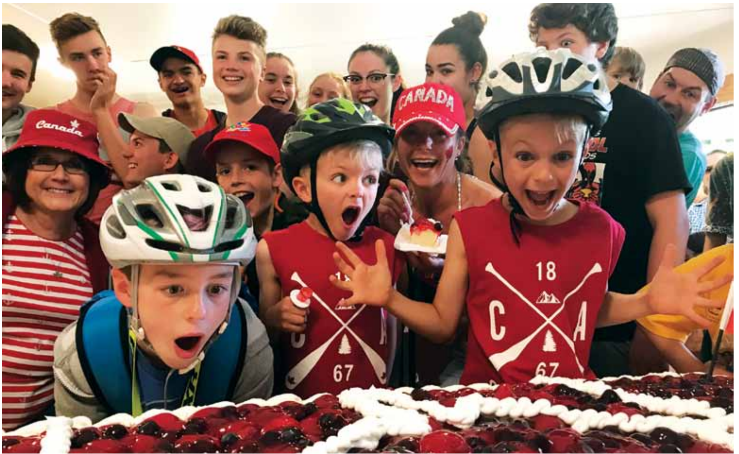
Happy 150th Canada! VB Kids were amazed in the VB Bakery on July 1 at 4 pm for the traditional cake giveaway!