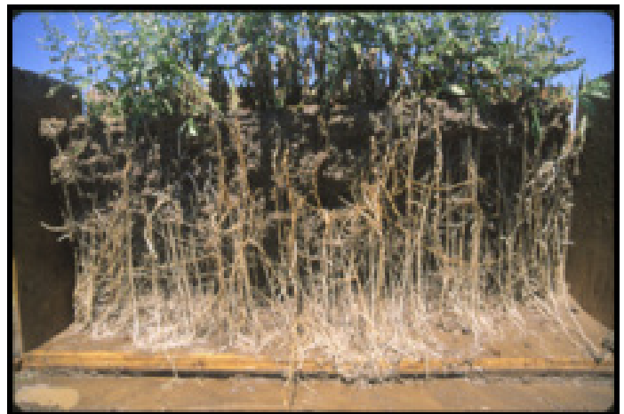
Canada thistle plants have extensive spreading roots that rapidly form dense colonies.

Figure 1 shows the summary of 36 research locations throughout the United States comparing control with common herbicides. Milestone at the labeled rates of 5 and 7 fl oz/A provides 85 and 91% control respectively the year following treatment.