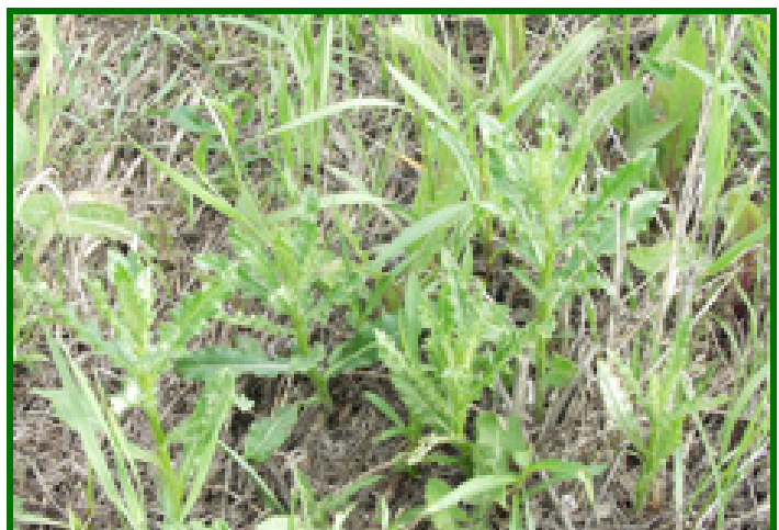
Too early to treat - wait until early emerging plants are in the bud stage.