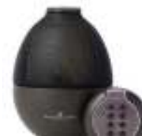
Rainstone™ Ultrasonic Diffuser