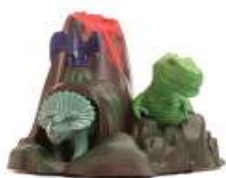
Dino Land Diffuser & Diffuser Cover

Dolphin Reef Ultrasonic Diffuser ~ Young Living’s Dolphin Reef Ultrasonic Diffuser features a playful mother dolphin and her calf swimming through color illuminated vapor released by pink sea sponges. The colorful coral, starfish, sea anemones, and a pearl-bearing giant clam will captivate your children’s imaginations and transport them into an undersea wonderland, all while enjoying the benefits of diffusing Young Living’s 100% pure, therapeutic-grade essential oils.