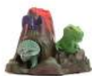
Dino Land Diffuser & Diffuser Cover