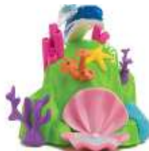
Dolphin Reef Diffuser & Diffuser Cover