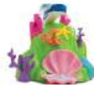
Dolphin Reef Diffuser & Diffuser Cover