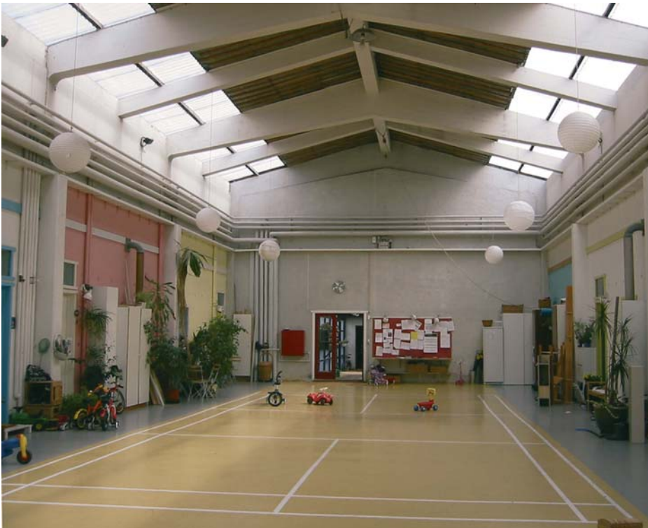
Common House Interior