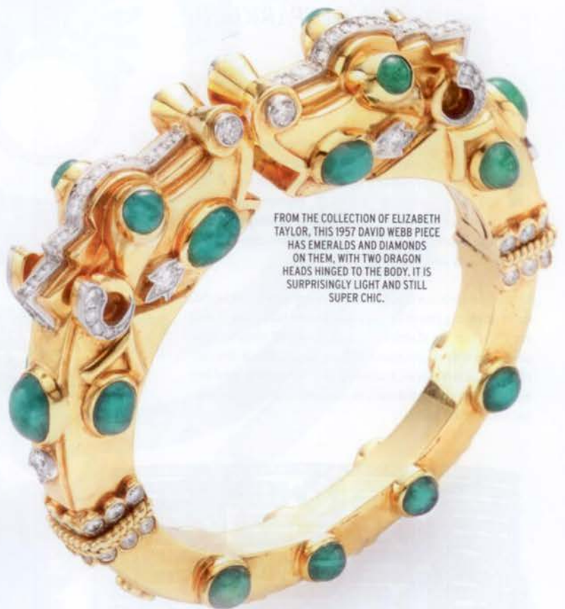
FROM THE COLLECTION OF ELIZABETH TAYLOR, THIS 1957 DAVID WEBB PIECE HAS EMERALDS AND DIAMONDS ON THEM, WITH TWO DRAGON HEADS HINGED TO THE BODY. IT IS SURPRISINGLY LIGHT AND STILL SUPER CHIC.