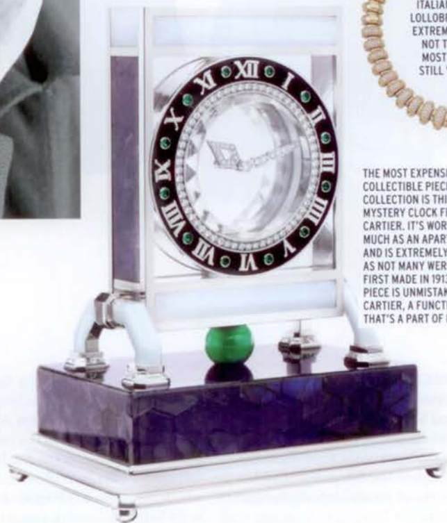
THE MOST EXPENSIVE AND COLLECTIBLE PIECE IN OUR COLLECTION IS THIS 1980S MYSTERY CLOCK FROM CARTIER. IT'S WORTH AS MUCH AS AN APARTMENT AND IS EXTREMELY RARE, AS NOT MANY WERE MADE. FIRST MADE IN 1913, THIS PIECE IS UNMISTAKABLY CARTIER, A FUNCTIONAL ART THAT'S A PART OF HISTORY.