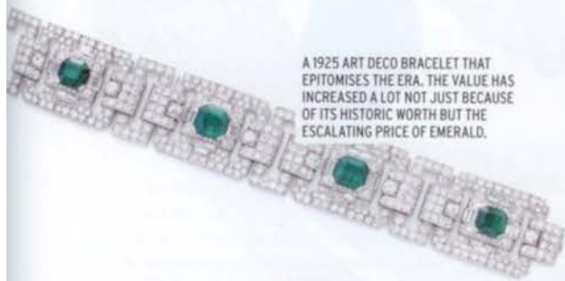
A 1925 ART DECO BRACELET THAT EPITOMISES THE ERA. THE VALUE HAS INCREASED A LOT NOT JUST BECAUSE OF ITS HISTORIC WORTH BUT THE ESCALATING PRICE OF EMERALD.