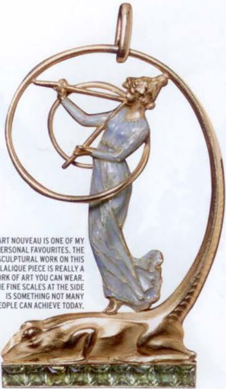
ART NOUVEAU IS ONE OF MY PERSONAL FAVOURITES. THE SCULPTURAL WORK ON THIS LALIQUE PIECE IS REALLY A WORK OF ART YOU CAN WEAR. THE FINE SCALES AT THE SIDE IS SOMETHING NOT MANY PEOPLE CAN ACHIEVE TODAY.