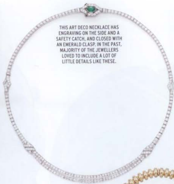
THIS ART DECO NECKLACE HAS ENGRAVING ON THE SIDE AND A SAFETY CATCH, AND CLOSED WITH AN EMERALD CLASP. IN THE PAST, MAJORITY OF THE JEWELLERS LOVED TO INCLUDE A LOT OF LITTLE DETAILS LIKE THESE.