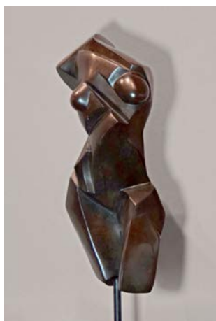
Female Nude