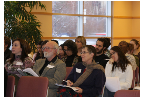
Audience listening to guest speakers