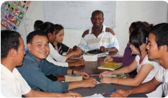
Photo caption: The Ad Gentes project has seen a Marist Brothers Community establish a similar education centre in Pailin, in north-west Cambodia

In partnership with the Marist Ad Gentes project throughout Asia, Australian Marist Solidarity is now helping to support forty young Burmese migrants (aged 15-25). They are living in Samut Sakhon, a coastal province in Thailand, and a program will be developed for them to acquire skills in basic computing and information technology. This will be combined with job referral assistance once these students complete their training modules at which time they will have the confidence to seek out paid-work opportunities.