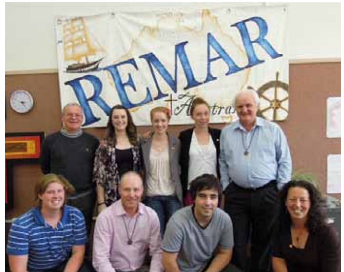
The people in Remar Ministry Team