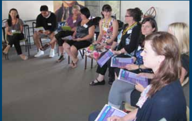
New staff from Marcellin College Bulleen at the In The Champagnat Way program which introduces those new to Marist schools to the character of Marcellin.