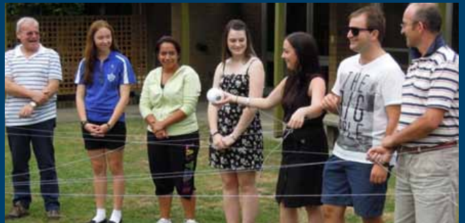
New Helms get to know each other before a session on Marist spirituality and our characteristic style of youth ministry