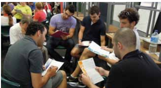
Young Marist men engaged in a discussion about Mary as Mature Disciple at the Marist College Emerald Staff Spirituality Day in mid-February.