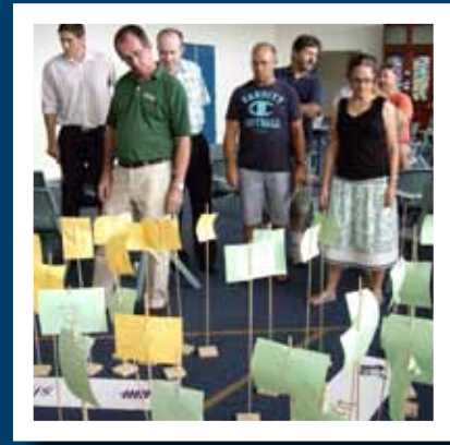
Staff group at St Mary's High School Casino who participated in a Staff Formation

An experience of gathering around the same table felt tangible at our recent Mission and Life Formation and Marist Schools Australia team meeting in Sydney. Our teams worked together to discuss and implement the most effective and practical ways that we can continue to serve the Marist school communities of Australia this year. The heart of our mission is to make Jesus Christ known and loved in our school communities. Our challenge is to offer effective formative opportunities and processes to encourage, nurture and develop this spiritual quest.