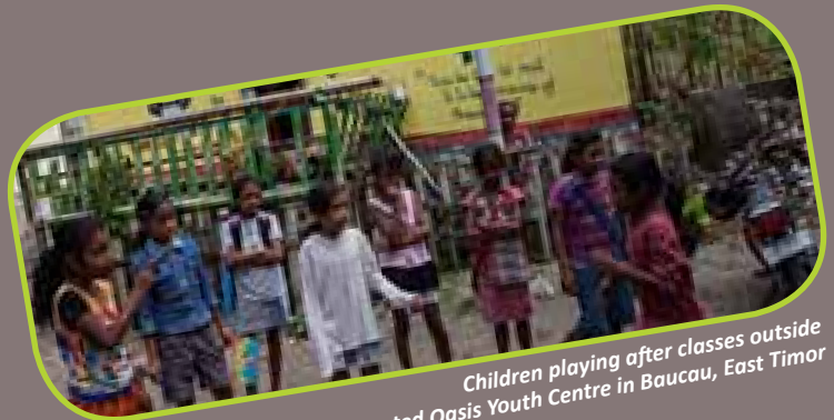
Children playing after classes outside the recently inaugurated Oasis Youth Centre in Baucau, East Timor

The support of MSA Schools for East Timor through the Marist Solidarity office, has enabled over 25 small projects for young people and five major school renovations. These partnerships are transforming the lives of our nearest neighbour.