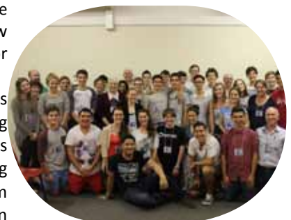
Students from QLD at the Yr 12 Vocations Forum at the Lavalla Centre

In 2013, the Vocations Team will be offering similar forums to students in Victoria, commencing with a Justice Forum for Year 11 students in October.