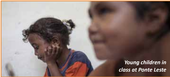
Young children in class at Ponte Leste

Although International Children's Day was celebrated last Saturday (June 1) Marist students in Australia are making children on the margins of life a priority everyday!