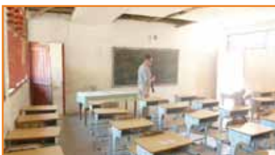
A classroom at Abafala Primary School in desperate need of repair.

Through Marist Solidarity (MSol) many schools support children in projects throughout Asia and the Pacific. One example of the great support that MSA Schools provide is a primary school in Abafala, Timor-Leste (East Timor). With 233 boys and girls in attendance the school's dilapidated facilities have struggled to provide the safe learning environment that all children have the right to experience. The support of MSA schools has been crucial in enabling the local Timorese to provide a safe school environment for their children.