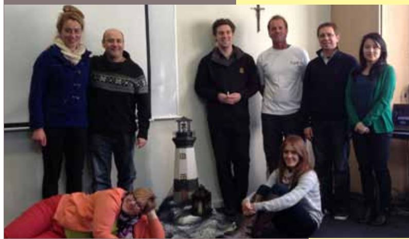
Gold Helm Inservice 2013