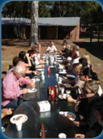
Sunshine Beach staff