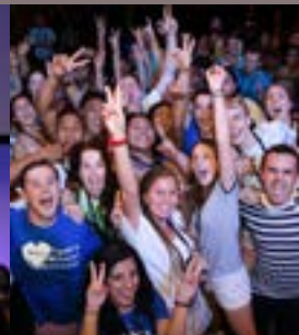
Participants celebrate their faith in community at MYF