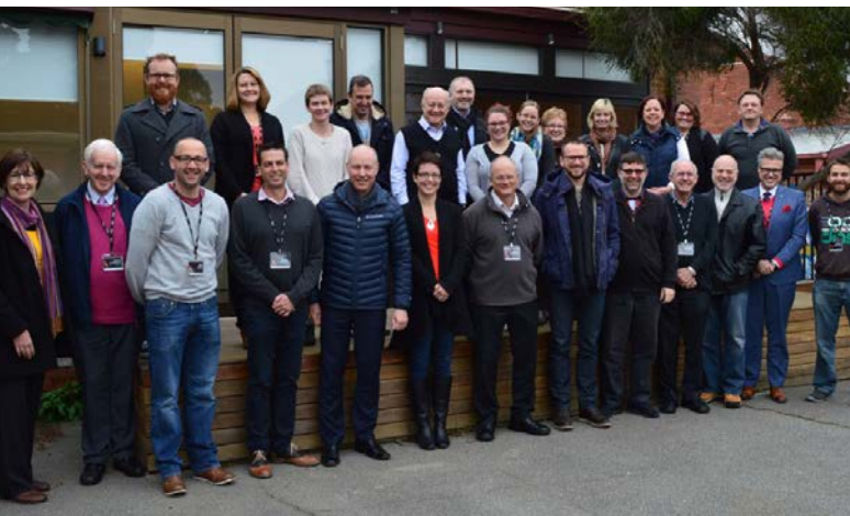
Mystics and Prophets participants