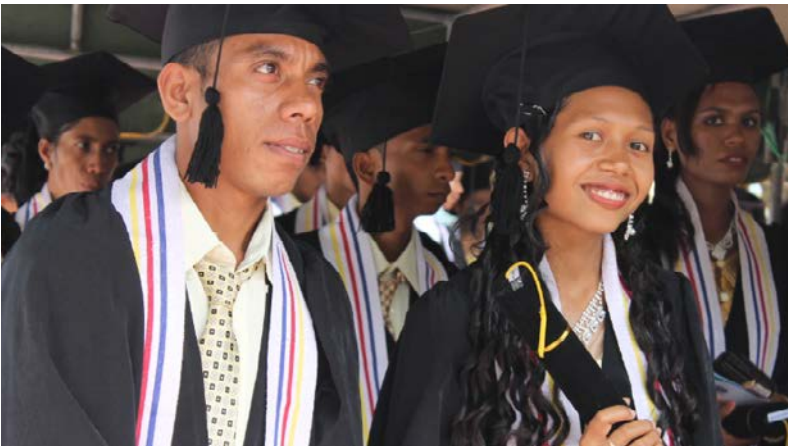
As graduates, these young men and women look to a future as teachers in Timor-Leste

Saturday, February 21 st , was an important day for the students of ICFP, the Marist initiated Teacher Training College in Baucau, Timor-Leste. Families of the fifty-one graduates travelled great distances to celebrate this exciting transition. It was also a moment to mark the commitment that they have made to shape the next generation of young people in their nation.