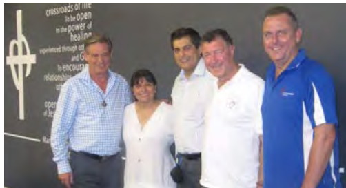
The John Berne School