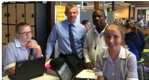
Marist College Bendigo