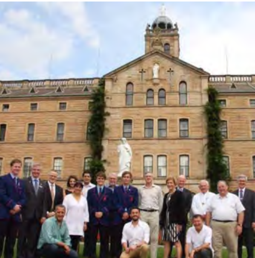
St Joseph's College

Last week, members of the International Marist Mission Commission were in Australia for their annual meeting. Before gathering at North Sydney on Wednesday, they spread across Brisbane, Melbourne and Sydney to visit various Marist schools and ministries. Here they are pictured at St Joseph's College, The John Berne School, Marist College Bendigo and Assumption College. Thanks to many Marists who acted as hosts to our guests.