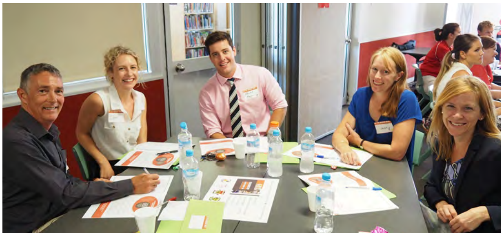
In the Marist Way - New Staff Induction Sydney Western Region, 8 March 2016