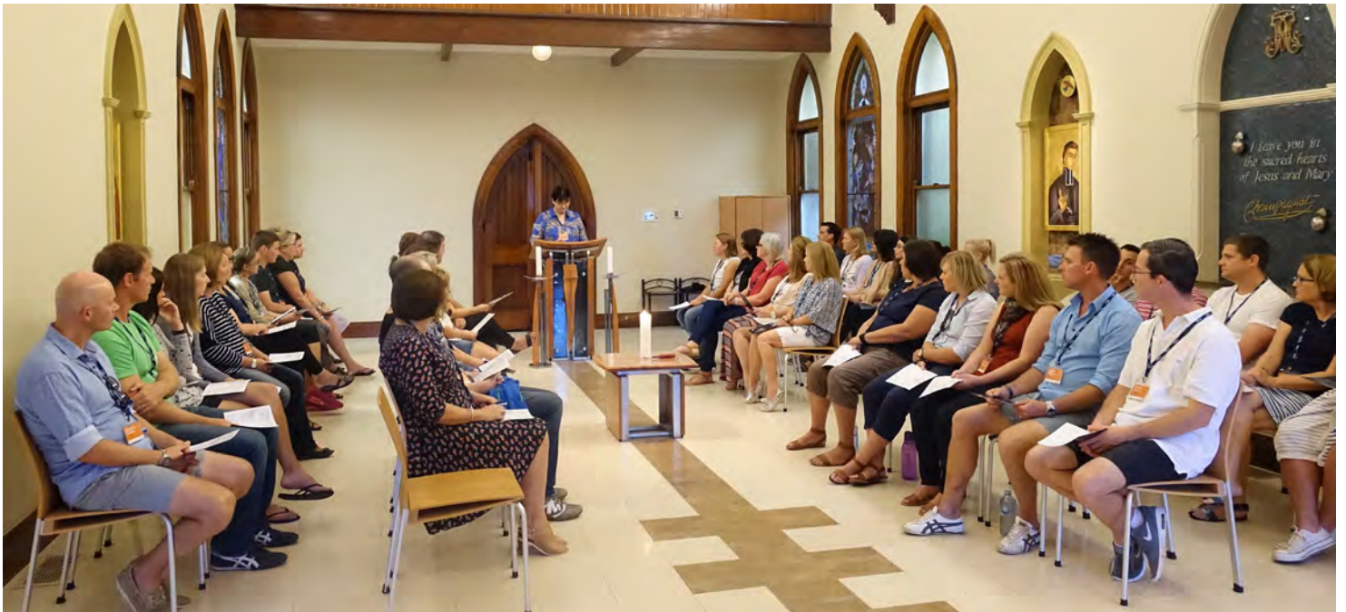
Footsteps 1 - Making Jesus Christ Known and Loved 13 - 16 March 2016