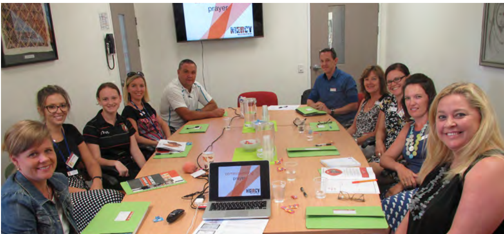
In the Marist Way - New Staff Induction St Teresa's Catholic College, Noosaville and St Thomas More Primary School, Sunshine Beach 10 February 2016