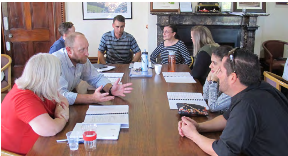
Marist Methodology Sacred Heart College, Adelaide, 14 April 2016