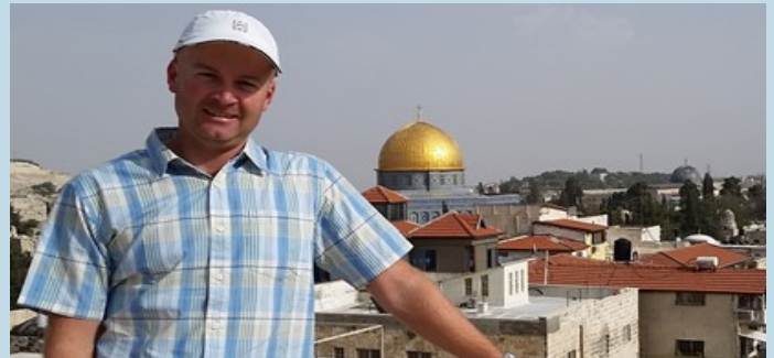
Marist Pilgrimage in Jerusalem 2015 and Le Puy 2016