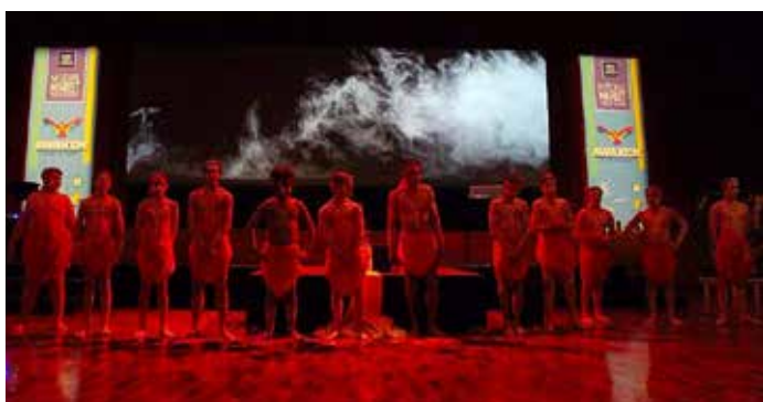
Thank you to the students of Champagnat College, Pagewood for sharing their ancient dances with us and introducing our Acknowledgement of Country.