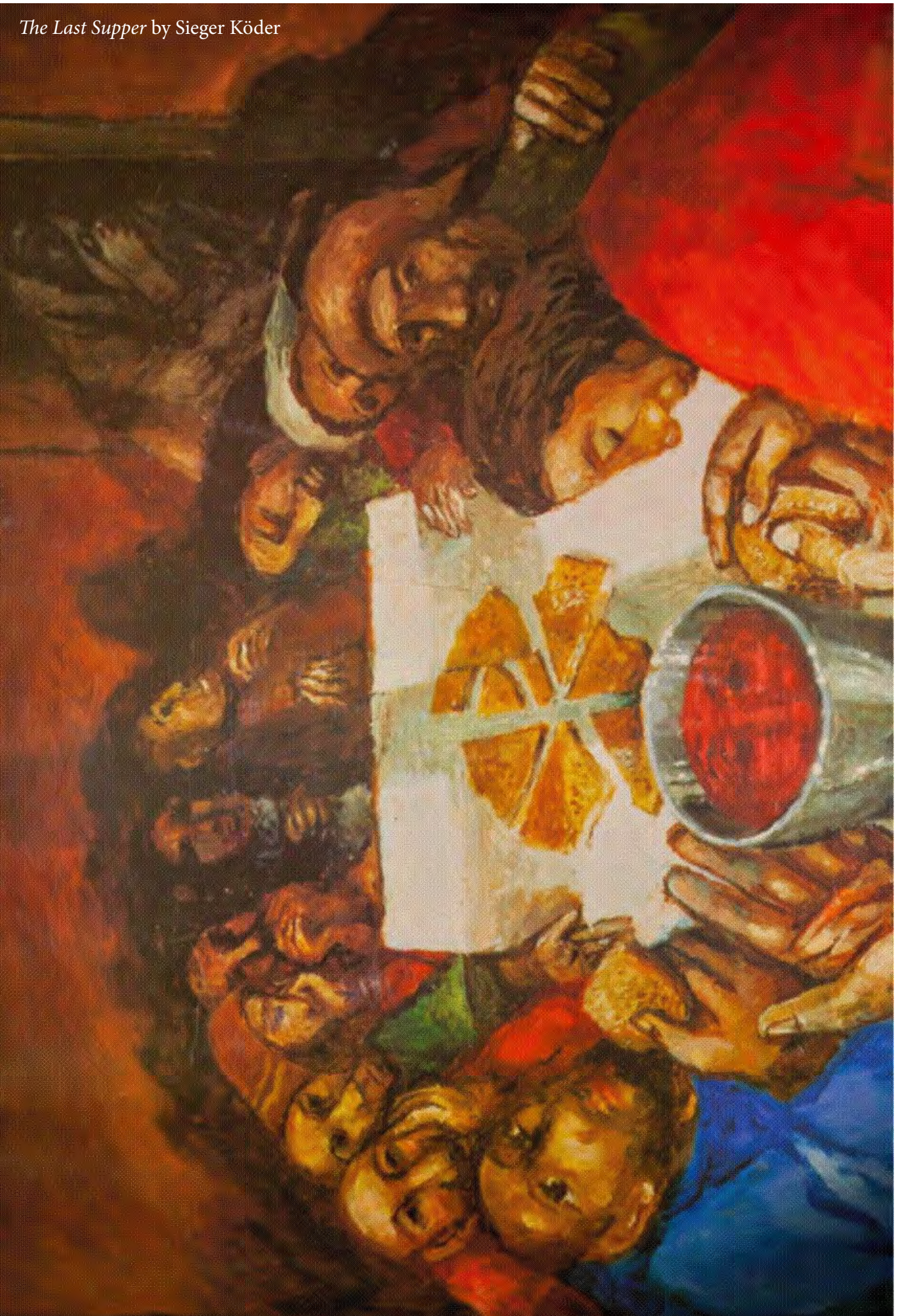
The Last Supper by Sieger Köder