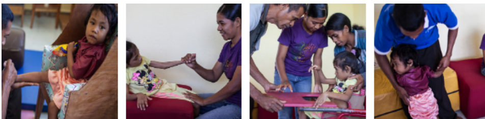
KATILOSA | TIMOR-LESTE