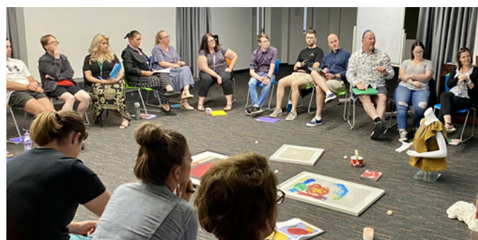
One Wild & Precious Life workshop at Marist College Bendigo on 13 March 2020