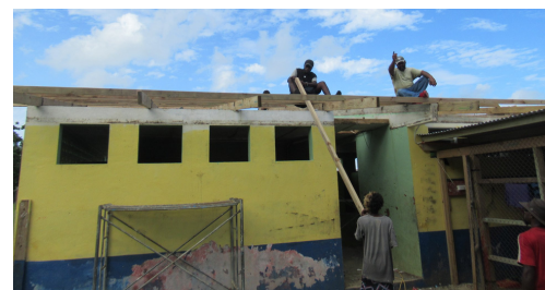
Boys' toilet and shower block