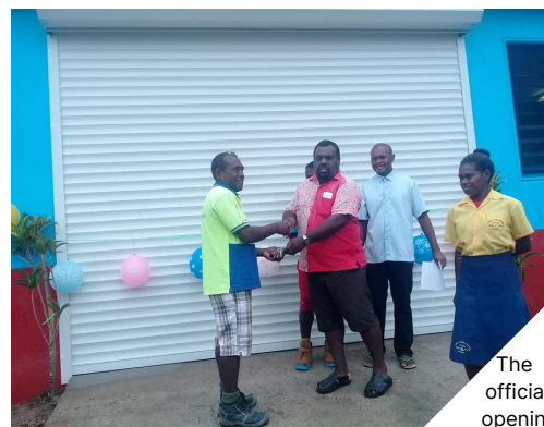
The official opening