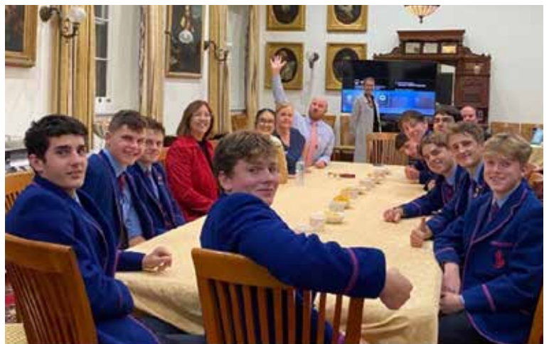
Above: Staff and Students at St Joseph’s College, Hunters Hill gather to watch the 2021 Marian Lecture