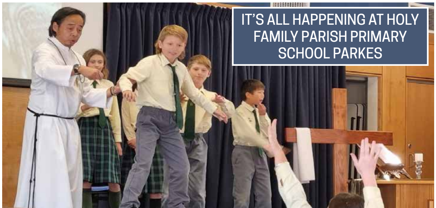
IT'S ALL HAPPENING AT HOLY FAMILY PARISH PRIMARY SCHOOL PARKES