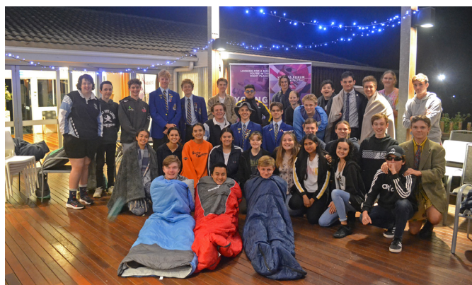
Marist Connect Night