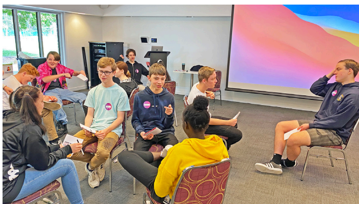
Yr 10 Regional Retreat

The Marist Centre Brisbane has been buzzing with the presence of Marist students. On Thursday 27th May, a dozen Year 10 Game Changers gathered for their Regional Retreat day. It was a day full of activities focused on how those students might impact and influence their peers and school communities . These discussions were grounded in the themes of solidarity and justice .