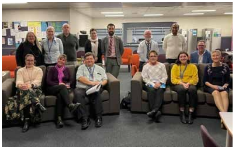
Above: A group gathered at Assumption College, Kilmore for the 2021 Marian Lecture