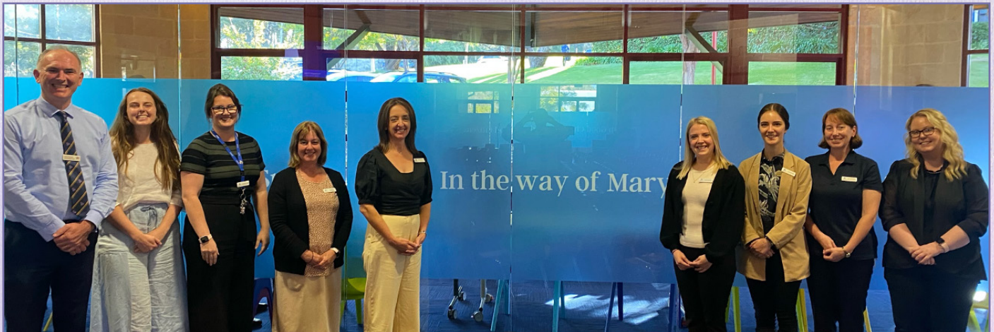
Above: Newman College In The Marist Way Program