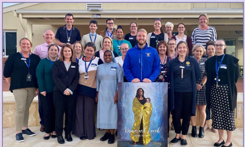
Above: St Joseph's School Northam gathered for the Known and Loved: Dignity for All Program

- Compendium of the Social Doctrine of the Church No. 132