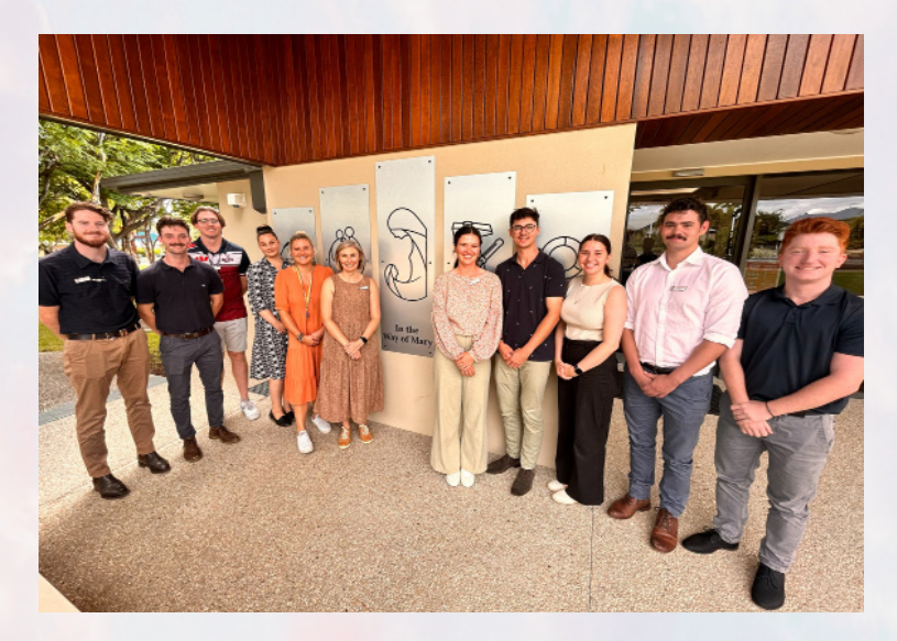
New staff at Marist College Emerald participated in the 'New Staff Formation' program.

"Life to the fullest" is God's gift to us, free and unconditional.