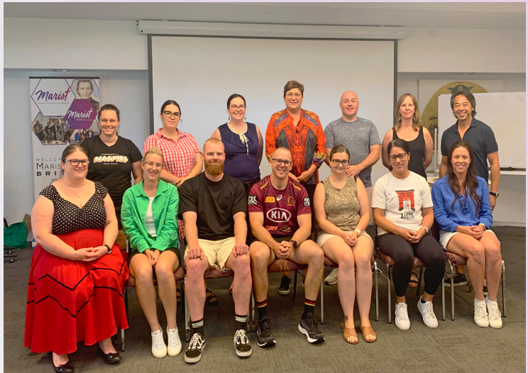
Middle Leaders from St Peter Claver College generously gave part of their holidays to participate in the Middle Leaders Program.