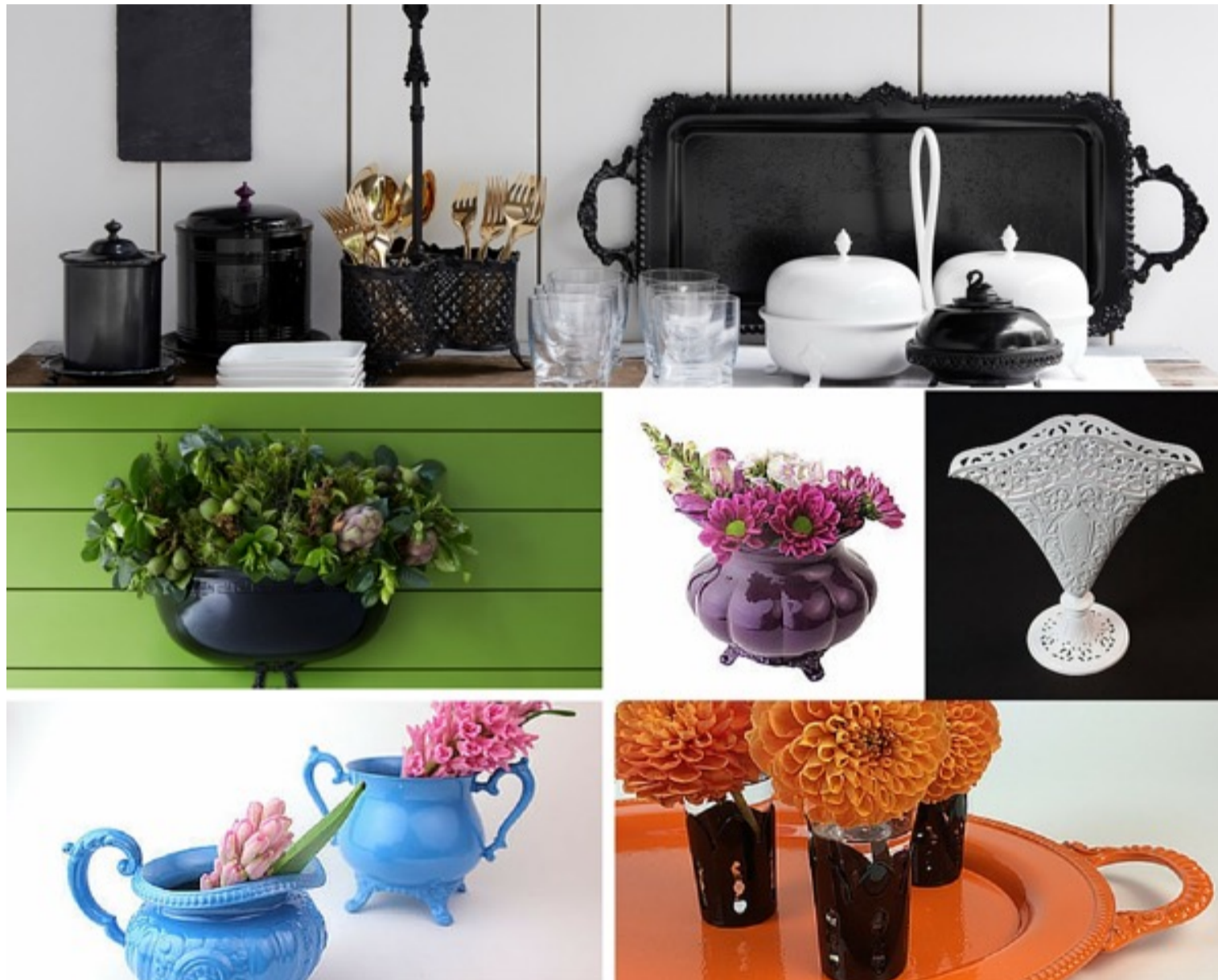
Julia Moss Designs