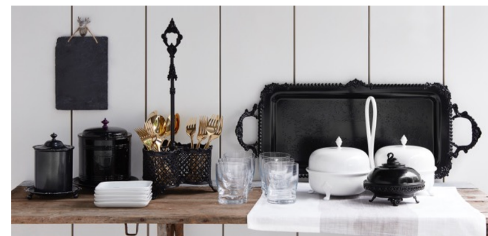
Julia Moss Designs

Finding a chic gift has never been easier or more fun, whether it is a personal treat or a highly unique gift for a special occasion. Purchase online at juliamossdesigns.com .