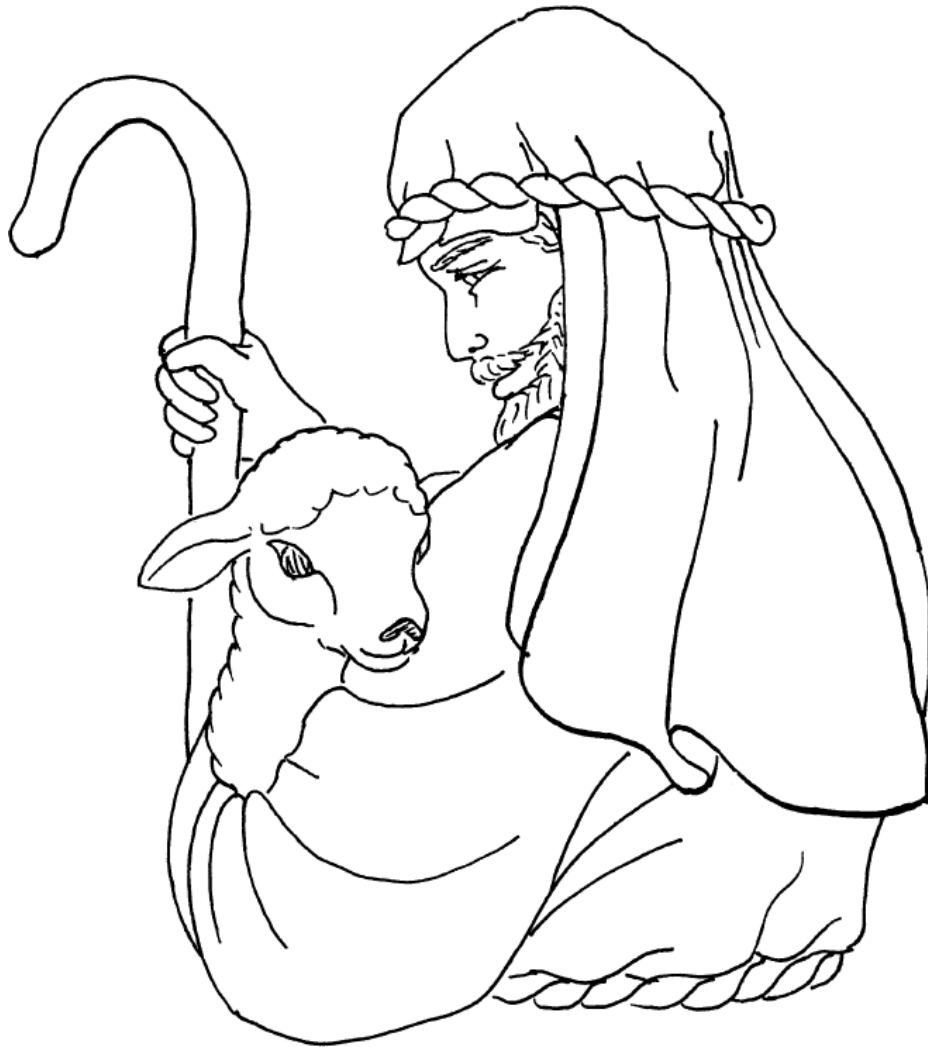
The Good Shepherd