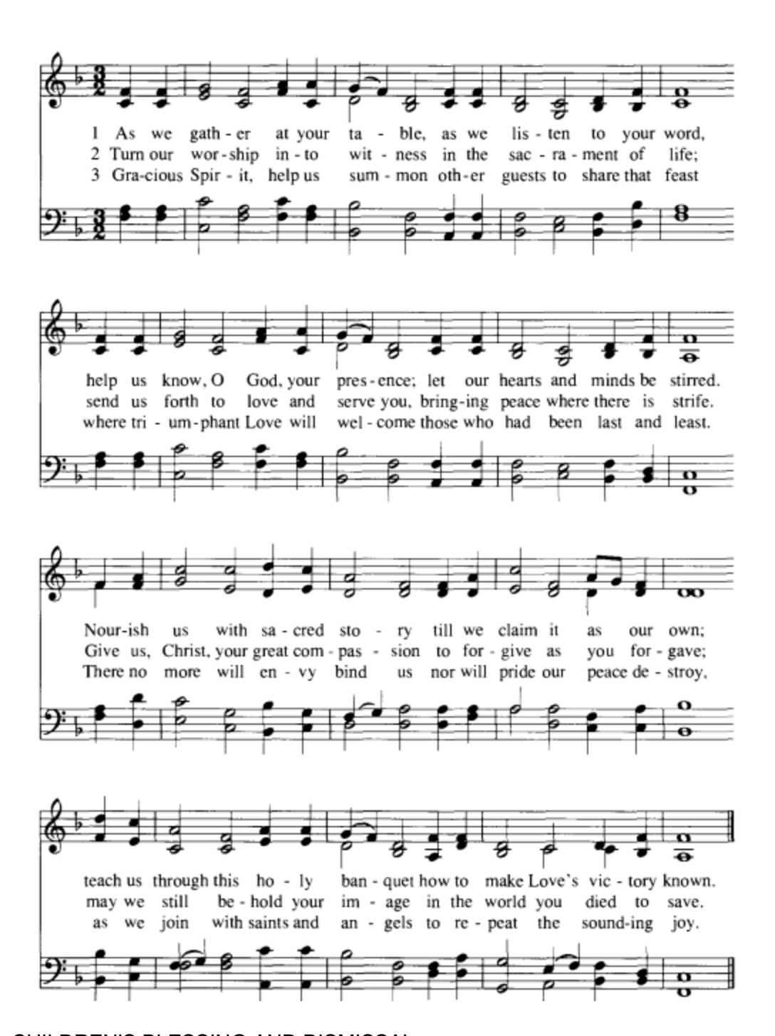
CHILDREN'S BLESSING AND DISMISSAL