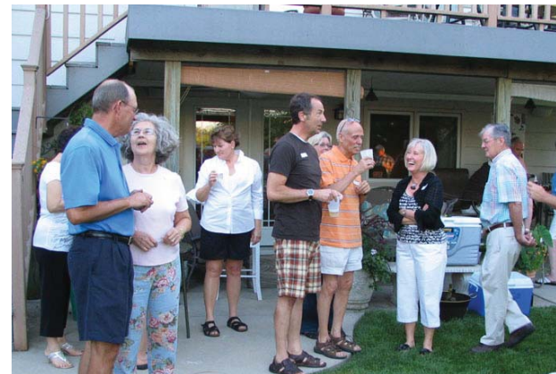
Garden Club at Pantheon Hosta Gardens