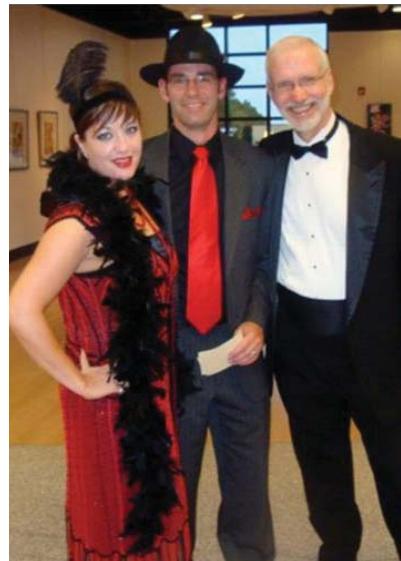
Left: An evening to remember at the "Roaring 20s" Arts at St. John's Kickoff Event.