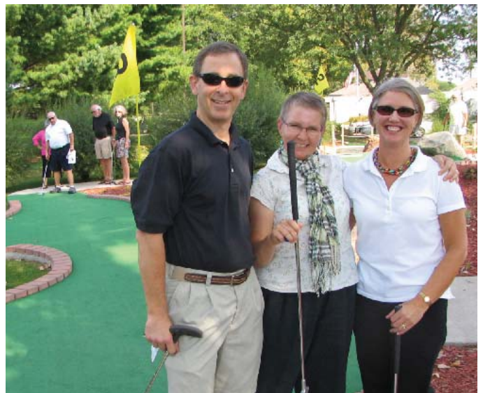
Bottom: Playing through at the Couples Plus Event in September.