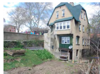
Future site of Community Garden

Garden State Episcopal CDC partnered with the Historic Jersey City & Harsimus Cemetery and other leading Jersey City organizations to create a fun-filled day for all at this beloved cemetery. Garden State CDC is overjoyed to assist with the development of the cemetery's Community Garden. Garden State staff, volunteers and clients will assist with revitalizing the site with planting and caring for the garden.