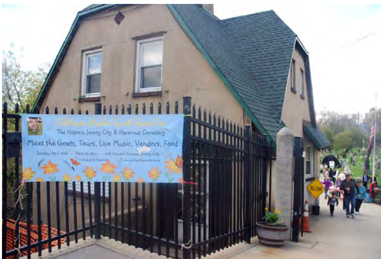
Mother Earth Festival, April 26, 2015

Garden State Episcopal CDC partnered with the Historic Jersey City & Harsimus Cemetery and other leading Jersey City organizations to create a fun-filled day for all at this beloved cemetery. Garden State CDC is overjoyed to assist with the development of the cemetery's Community Garden. Garden State staff, volunteers and clients will assist with revitalizing the site with planting and caring for the garden.