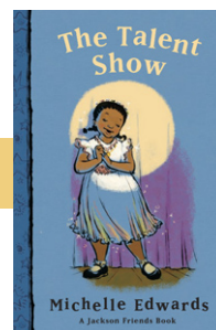
The Talent Show Harcourt 2002 ISBN 0-15-205760-9