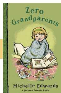
Zero Grandparents Harcourt 2001 ISBN 0-15-205754-4