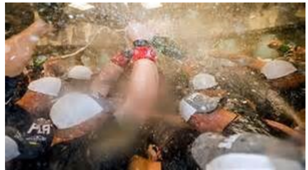
The Atlanta Braves won the NL East.