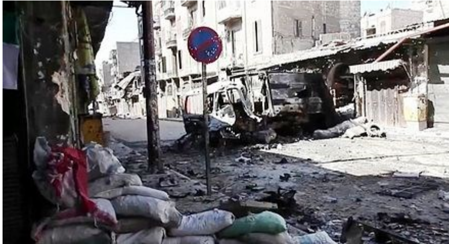
August 21st, a Sarin Gas bomb was used by the Syrians during their Civil War.