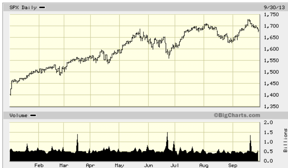
S&P 500 January—September 2013

What we have been seeing since early 2009 is the precise recipe for a Bull Market; market participants talking about all the risks and problems while stocks rally and rally. The phrase used for this is that the market has been climbing the Wall of Worry. And through the end of the 3rd quarter, the S&P 500 has posted a gain of 19.79% on a total return basis during this climb.