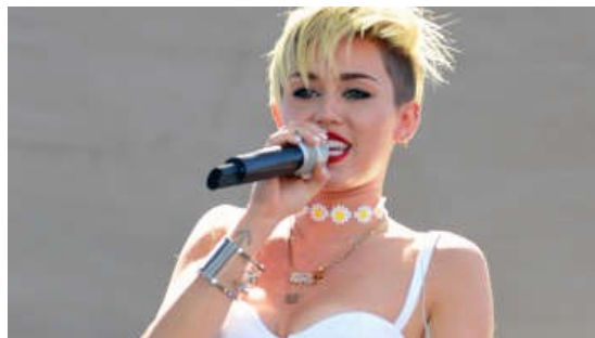
Miley Cyrus gave a performance that seems to prove that she's...uh, hmmm, well,...lost her mind!