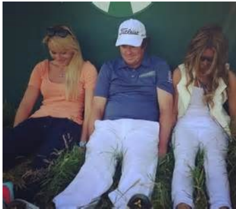
Jason Dufner won the PGA Championship