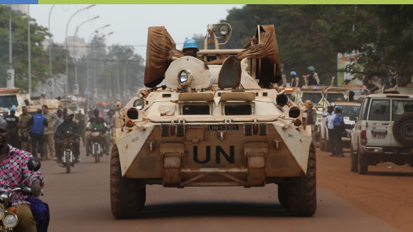
Peacekeepers serving with MINUSCA patrol the streets of Bangui, Central African Republic.

The Nkurunziza regime claimed the office was no longer needed because Burundi had made sufficient progress in putting in place national mechanisms for the protection of human rights.