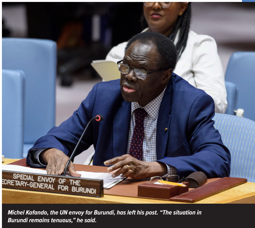
Michel Kafando, the UN envoy for Burundi, has left his post. "The situation in Burundi remains tenuous," he said.

Victims reported that Imbonerakure militants at food distribution centers managed by aid groups beat people, prevented them from getting food, or forcibly took food from them.