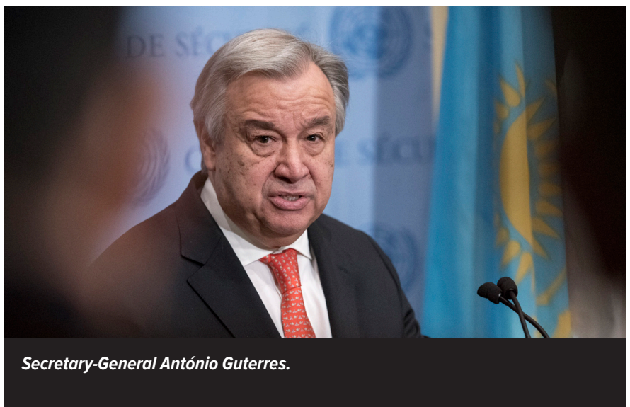
Secretary-General António Guterres.

After a year of investigation, the UNIIB released its report in September 2016. It detailed widespread sexual and gender-based violence against women and girls by regime forces. The UNIIB said it documented “a number of cases” of sexual mutilation.