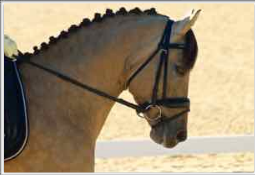
Champ at the inaugural USDF Nationals in 2013.

Of the 25+ foals he sired the majority of them inherited his beautiful dun coloring and all of them possessed his wonderful temperament. Champion's Devito was the USDF Adult Amateur Champion at First Level in 2013 with a median score of 74.083% and was