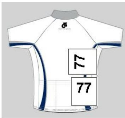
MASS START * also use frame plate