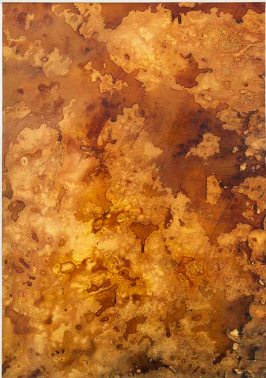
Stuck 2014 29.7 x 42cm Ink on paper £750 (framed)