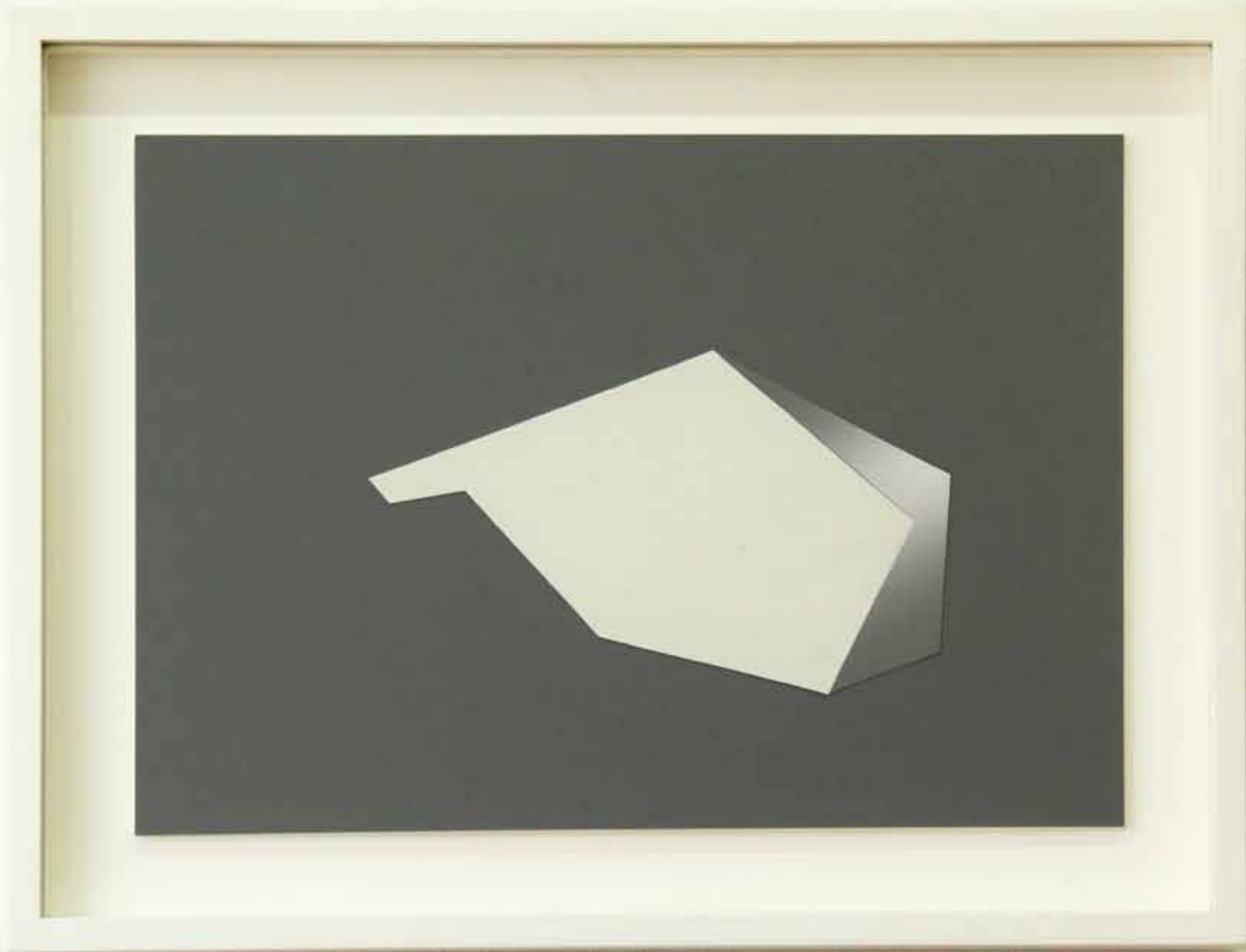
Amy Stephens Pause, 2015 30 x 21cm Framed Collage £700