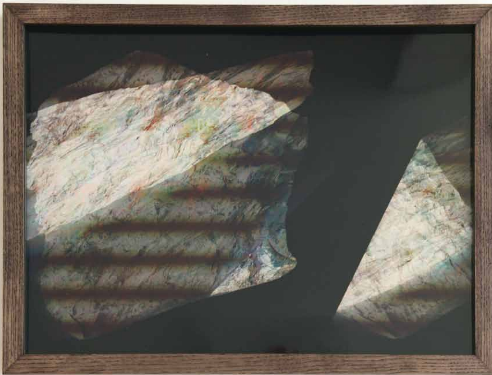
James Irwin Silicone Shuffle (unmask), 2014 38 x 26cm C-Type print, framed £450