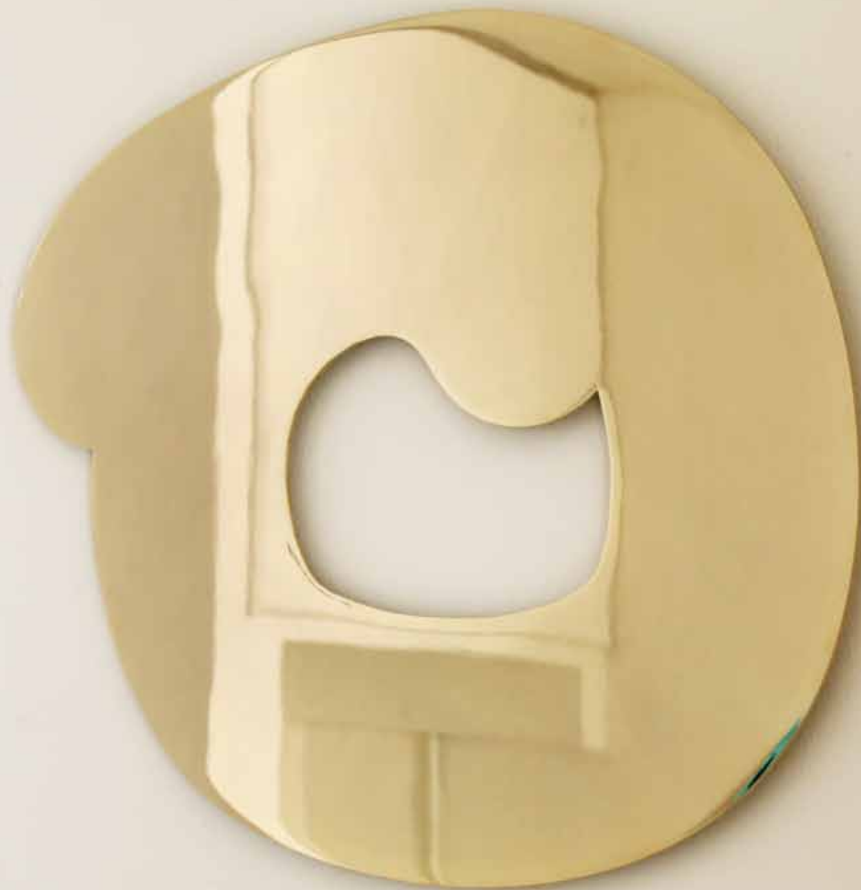
Mark Davey Trust, 2015 43 x 37cm Gold plated steel £800 edition of 3