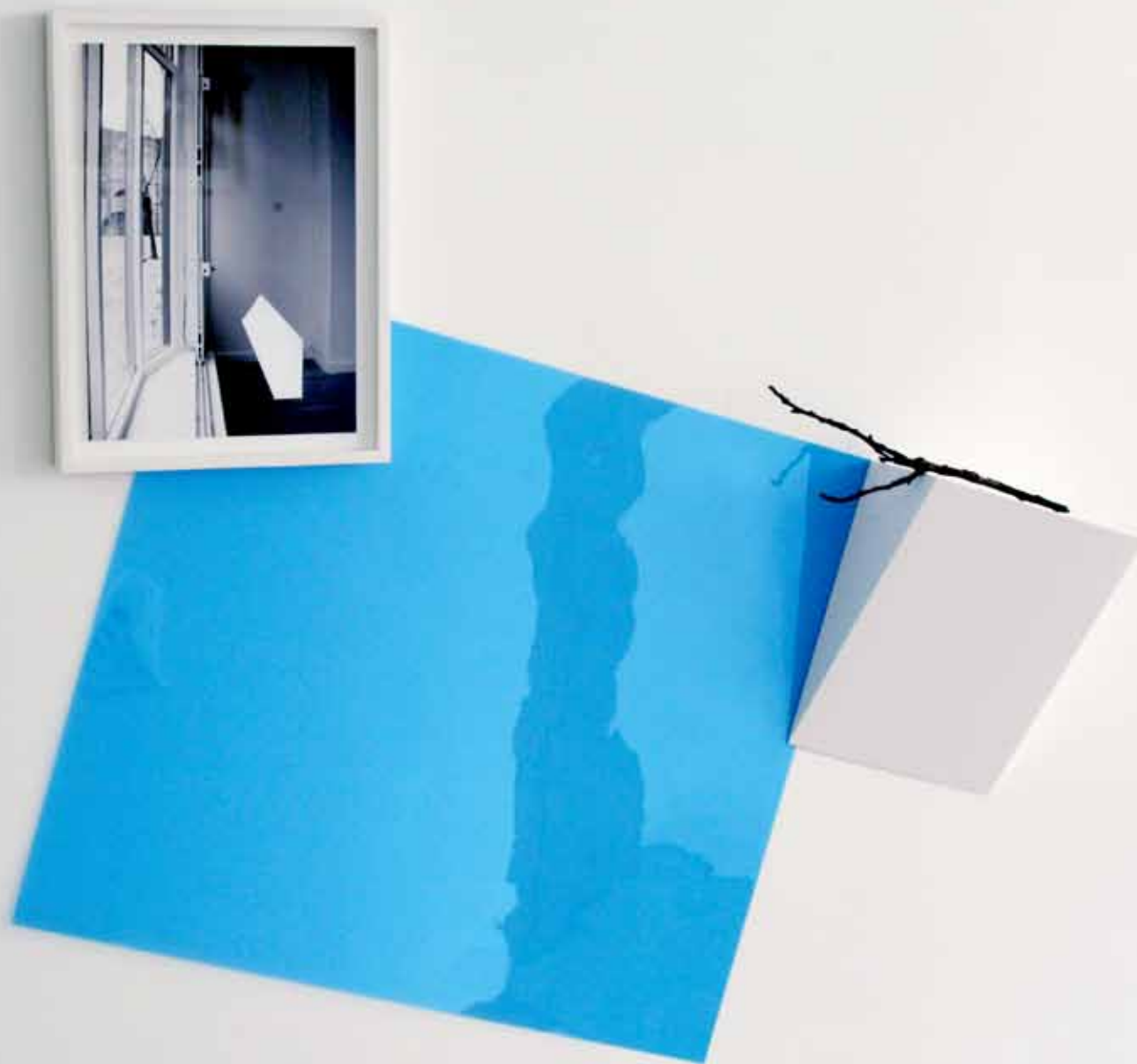
Amy Stephens Industrial Symphony, 2015 Dimensions variable Framed photograph, acrylic, wood, enamel, lighting gel £1,200