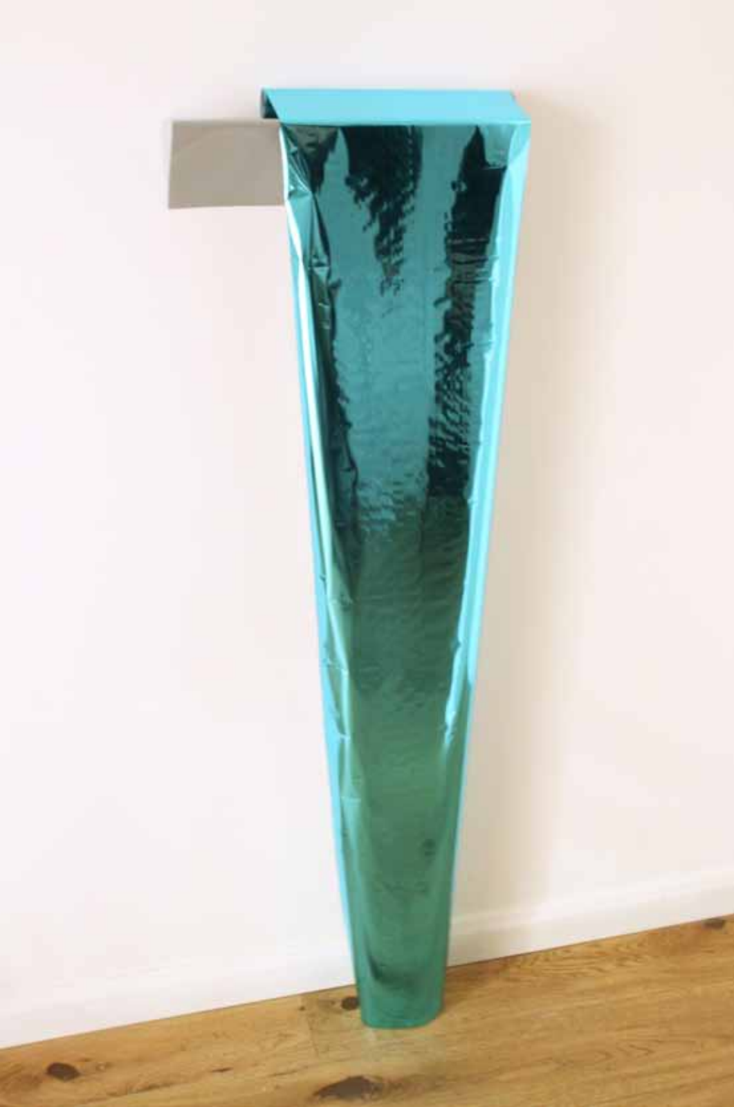
Amy Stephens The First Dive, 2013 42 x 130 x 10cm Steel, paint, heat transfer foil £1,300