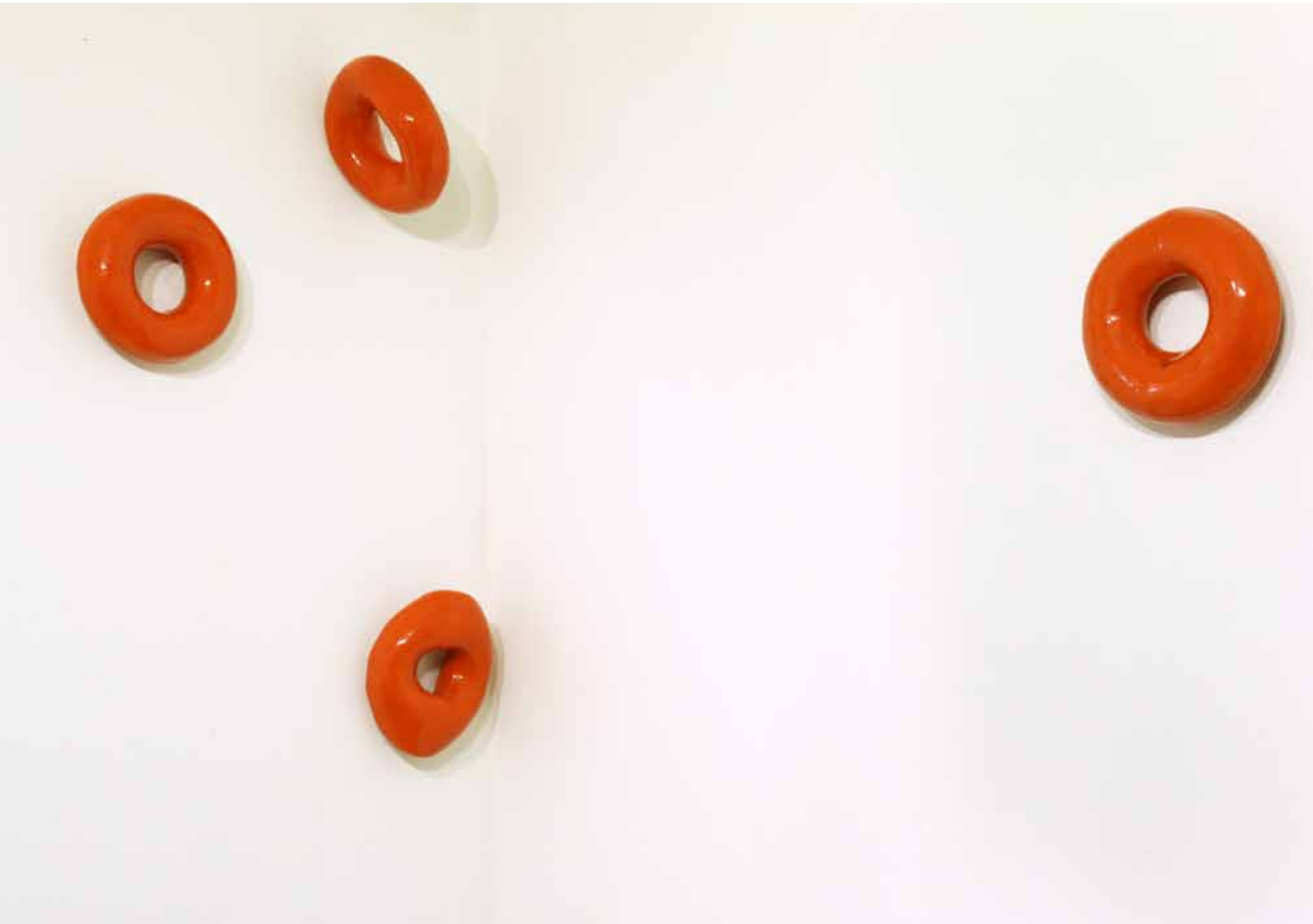
Julian Wild Elements, 2010 Dimensions variable Glazed stoneware ceramic £300 each