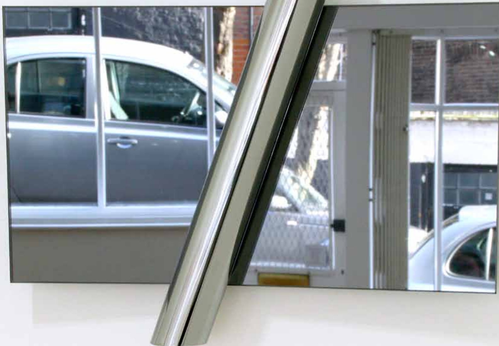
Mark Davey Changing Room, 2015 43 x 25cm Black glass, chromed steel £1,000