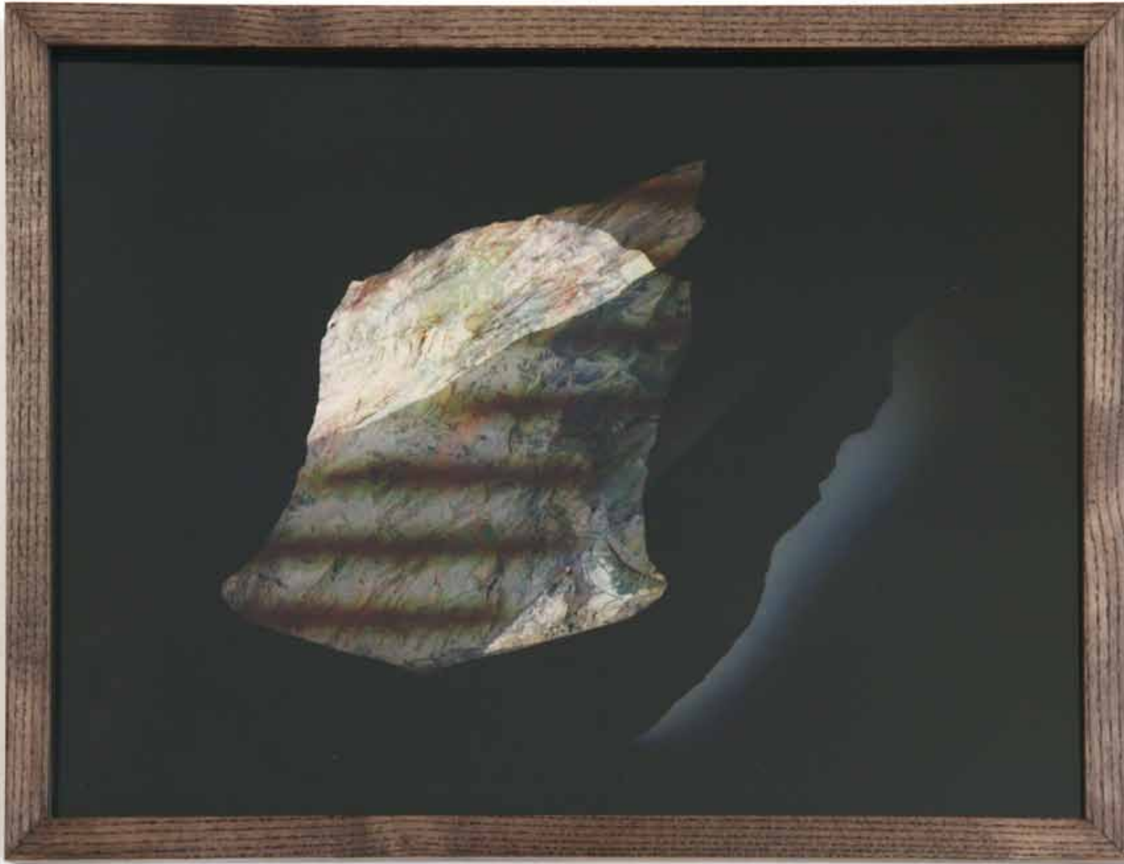
James Irwin Silicone Shuffle (mask), 2014 38 x 26cm C-Type print, framed £450