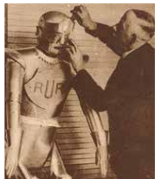
Chris Pictopopay / Alu Pictopopay Illustration

Injecting your journey with energy and humour, this quirky theatrical experience celebrates the history and character of Blackfriars Road and Southwark. The streets will come alive through a series of unexpected sights, featuring actors, artists and musicians.