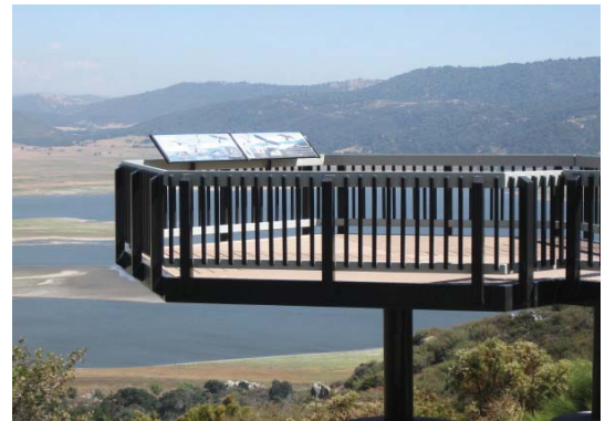
Metal Overlook Platform / Landing